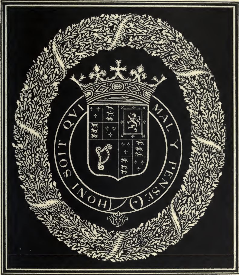
HENRIETTA MARIA, WIFE OF CHARLES I.